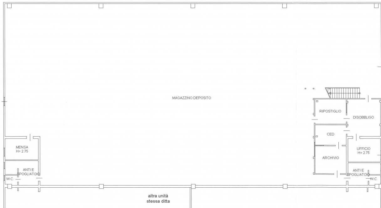
PIANTA PIANO TERRA H=7.00m